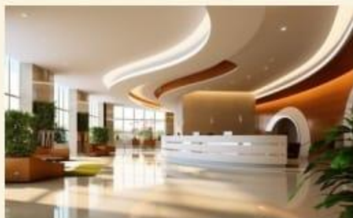
Double Height Entrance Lobby with Reception and Concierge