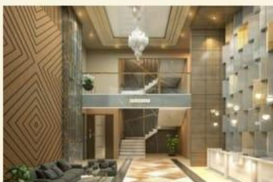
Grand Entrance Lobby with High Security