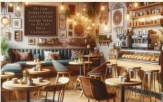
Café with all day dining