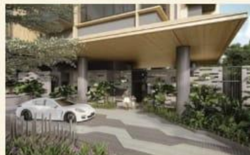
Drop Off Porch