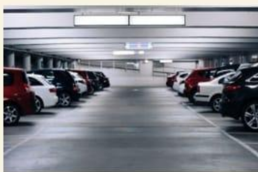
Basement Car Parking