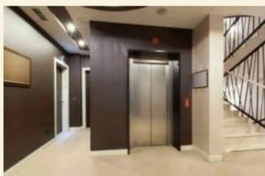
Separate Elevators for Services