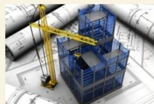
Earthquake Resistant Structure