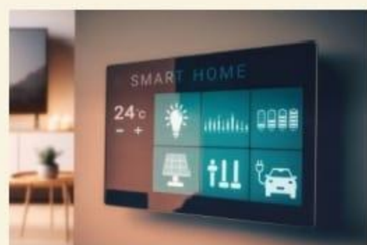
Fully Automated, Wi-Fi Enabled