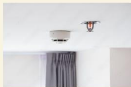
Sprinkler System & Smoke Detection System