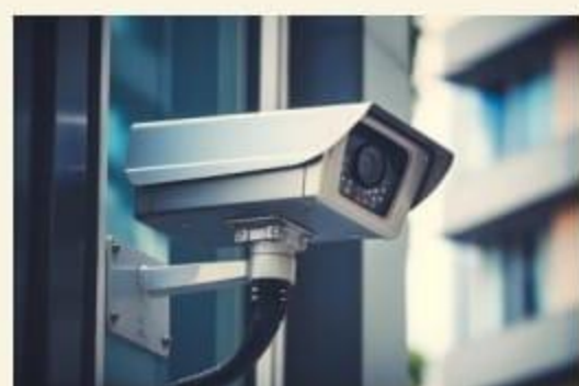
24 Hrs Security,