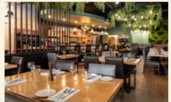
World Cuisine Restaurant