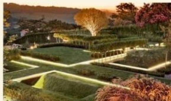
World Class Landscaping by International Consultant