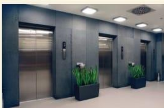
High Speed Elevators